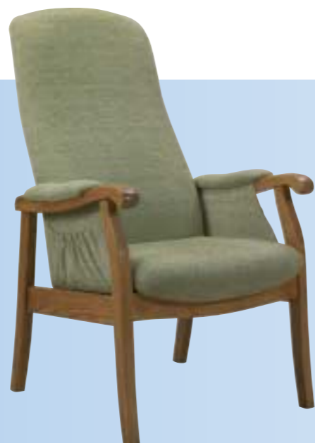
DELPHI AVERAGE CHAIR

The Delphi Chair has a deep lumbar section with firm seating and offers a choice of three seat heights. It is available with or without side panels