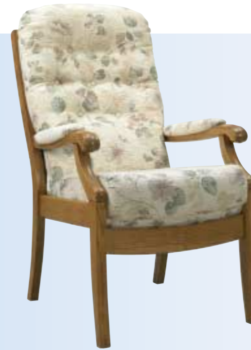
WINCHESTER HIGH SIT CHAIR The Winchester High Seat Chair provides supportive back and seat cushions and offers a choice of three heights. It is available with or without side panels