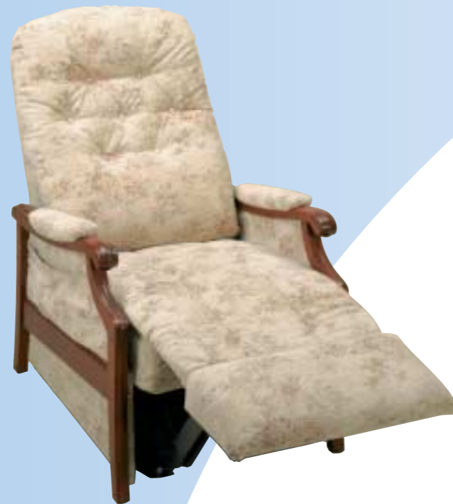
RISER RECLINER (PARTIALLY RECLINED)