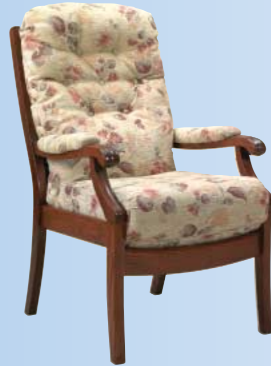
WINCHESTER PETITE CHAIR Offers a sumptuous yet supportive back and seat cushion. It is available with or without side panels.