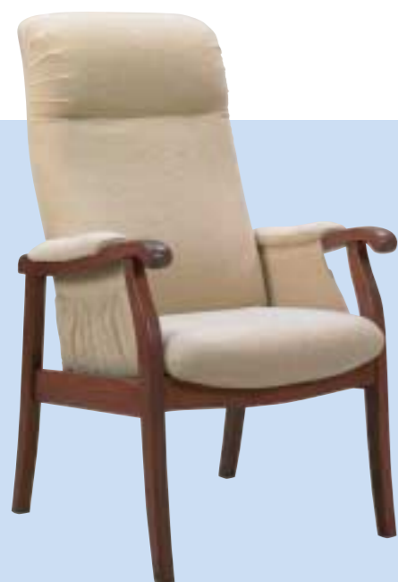
ALBANY TALL CHAIR

The Albany Chair has an upright back with firm seating and offers a choice of three seat heights. It is available with or without side panels