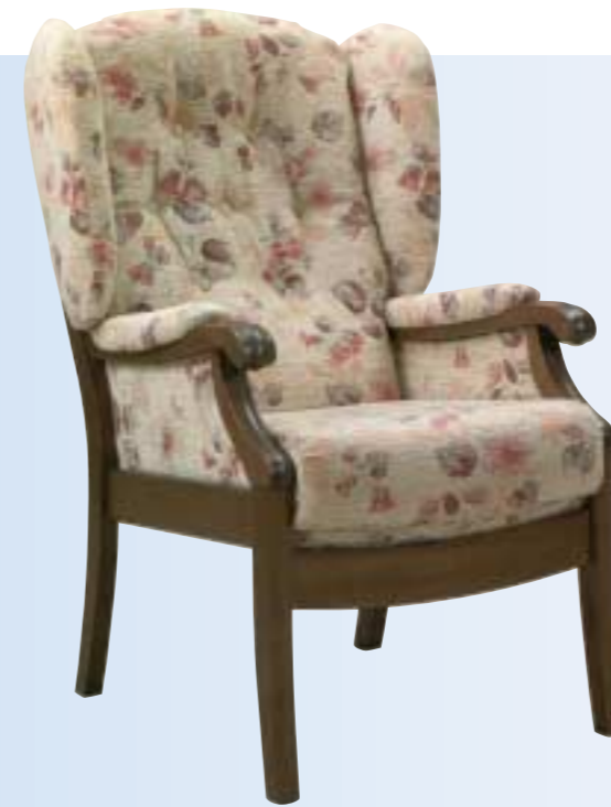
SALISBURY HIGH SIT CHAIR

The Salisbury chair offers a choice of three heights, and is available with or without side panels.